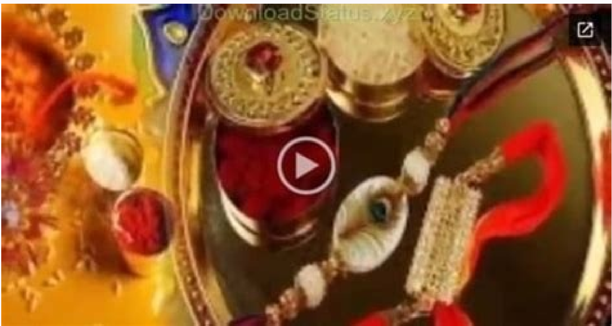
O behna meri behna song status download.